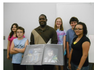
the bodies and clothes for our characters, and we could choose a

The instructor taught on how to draw different manga styles of eyes, noses, and mouths; and how to place them on the face. We then learned how to draw