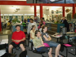
discussion of his book: Fang Face