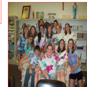
Teen volunteers at St. Christopher's VBS

Games were held either inside or outside, depending on the type of game. All of the crafts were done in the cafeteria. At the end of each day the children got together and sang the new song that they'd learned that morning or day before. All of the children and counselors got t-